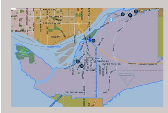
North Delta (Districts 3 & 4)