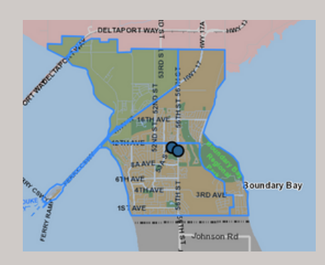
Ladner (District 2)